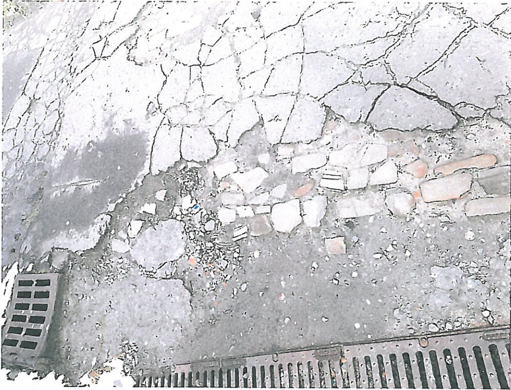
Fot. Nr 1