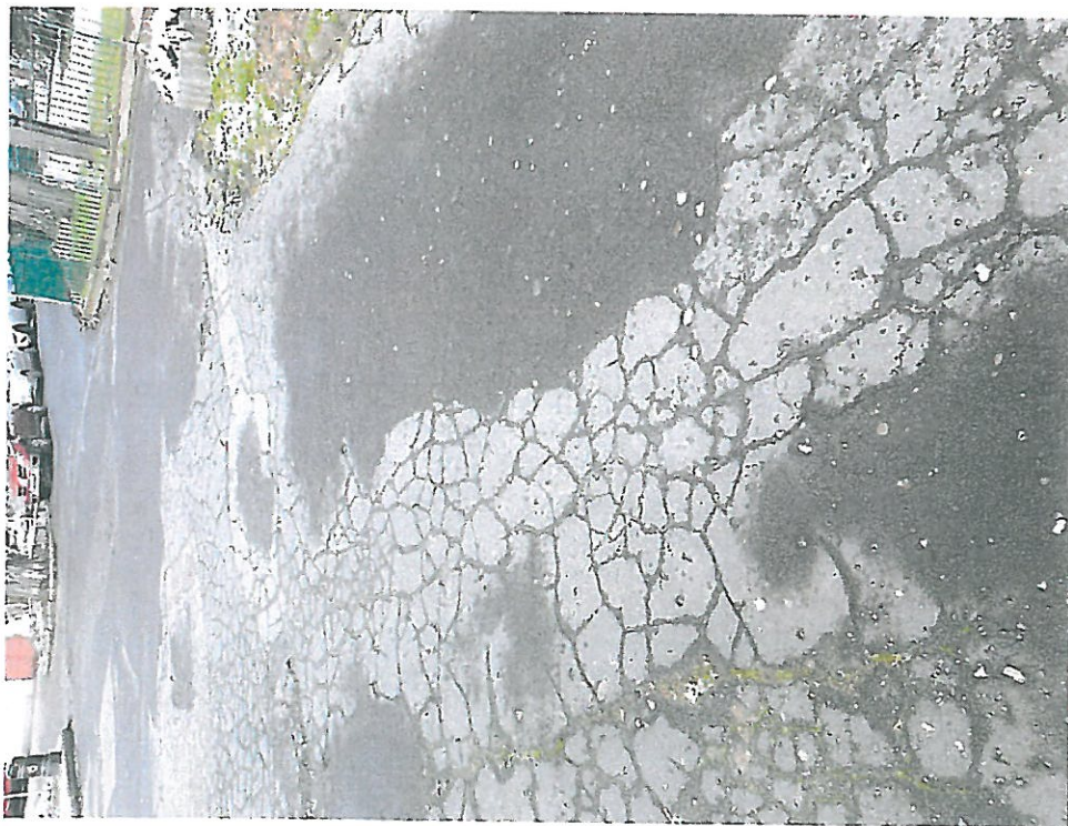
Fot. Nr 4