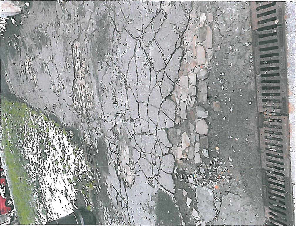
Fot. Nr 2